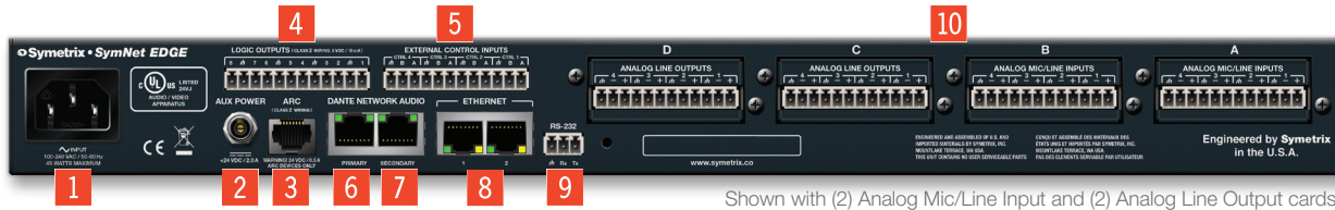
Shown with (2) Analog Mic/Line Input and (2) Analog Line Output cards.