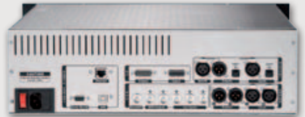
FALCON 50 FM REAR