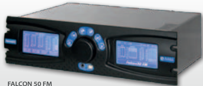
FALCON 50 FM

The dedicated 'Bass Enhancer' stage delivers a strong and effective 'drum punch' for a deep musical emotion.