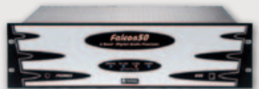
FALCON 50 FM BLIND